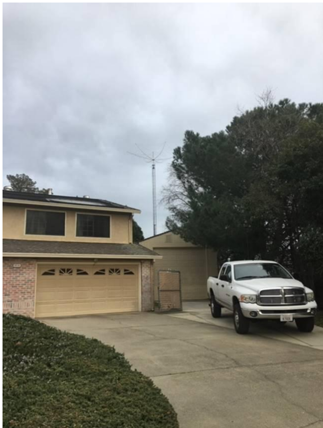
K7QDX's HEX beam

K7QDX also does mobile HF with a Kenwood TS-480 with a Larheel 200 screwdriver antenna. Along with VHF, UHF, and 900 Mhz.