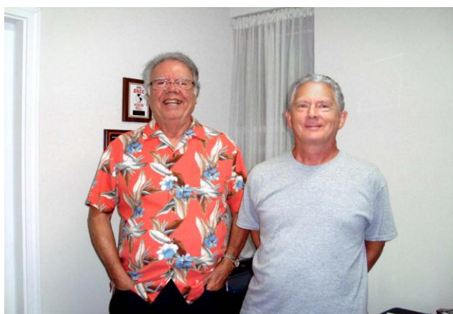
I/r: W6SR & WO4O