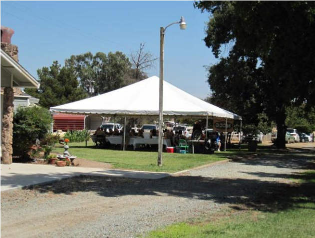
Our eating Venue