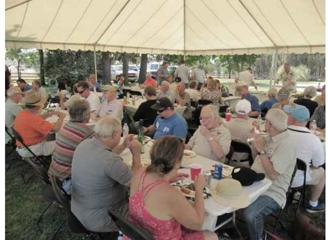
Another Lunch Pic.