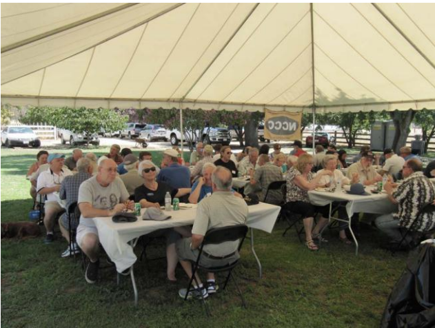
Members Chowing-Down on BBQ lunch