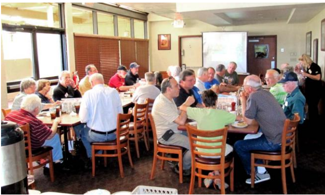
Members chowing-down at our March meeting