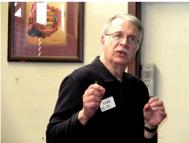
K6MM presenting our March program, Palmyra, the K5P Dxpedition