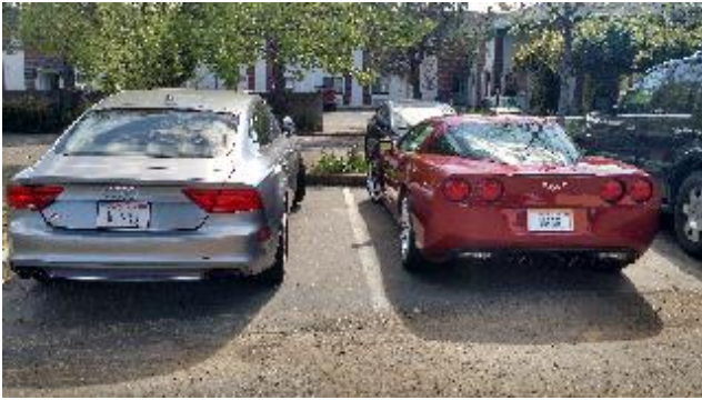
Sweet Rides at our March meeting