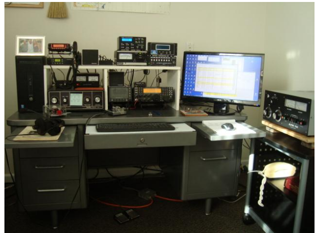
The W6SR shack now looks like this

I operated a bit in the CQWW CW, ARRL 160M and 10M contests, not a lot of time spent, but nearly 1000QSO's total. No new DXCC band-countries either, so pretty much status quo around the old radio ranch.