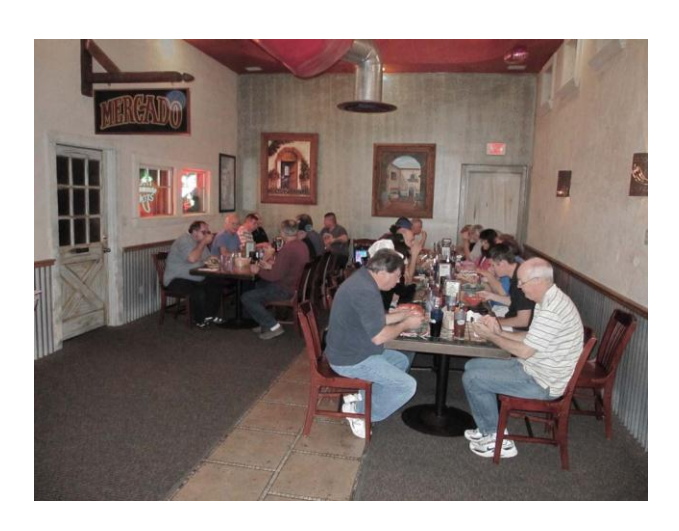
Yum! Lunch is served.

Pictures from our March meeting at Habanero Hots in Lodi.