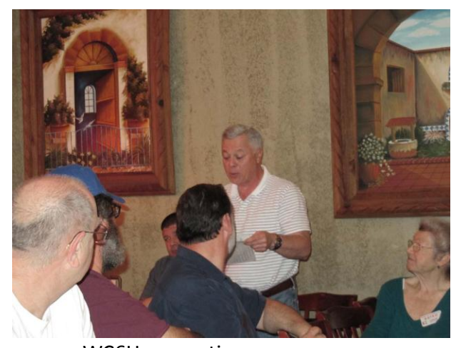
WC6H presenting our program