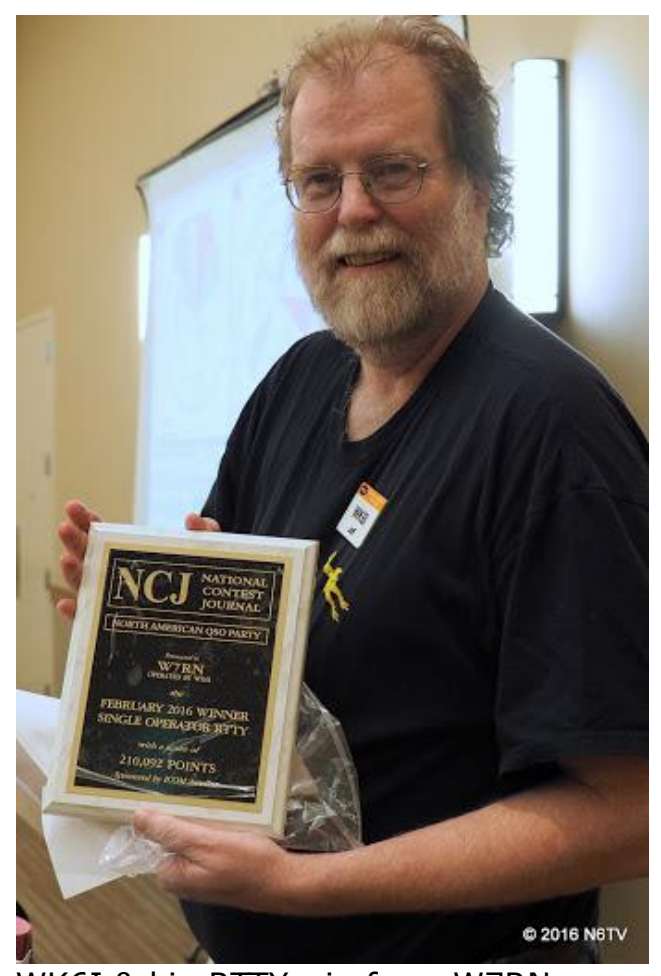
WK6I & big RTTY win from W7RN