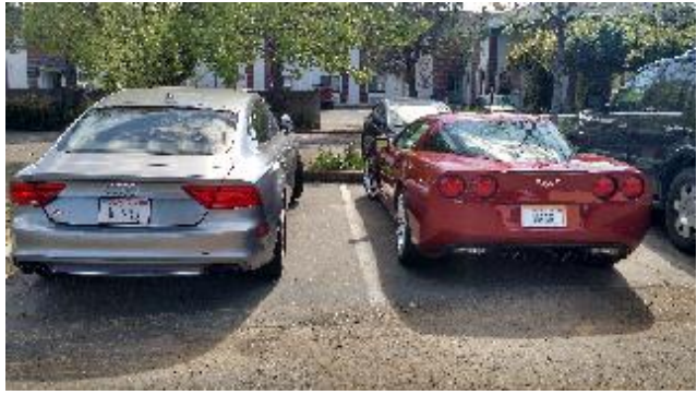
Sweet Rides at our March meeting