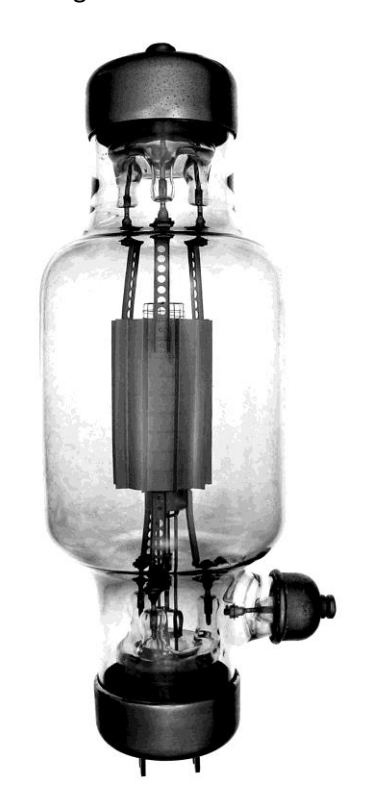
Visit the museum at N6JV.com Norm N6JV

This example was found at a ham swap and I didn't know what it was at the time. This tube isn't marked. I suspected H&K but it was some time before I found complete H&K tube manuals and data sheets. I have never seen another example and don't know how many were actually produced although H&K was still advertising them in 1946.