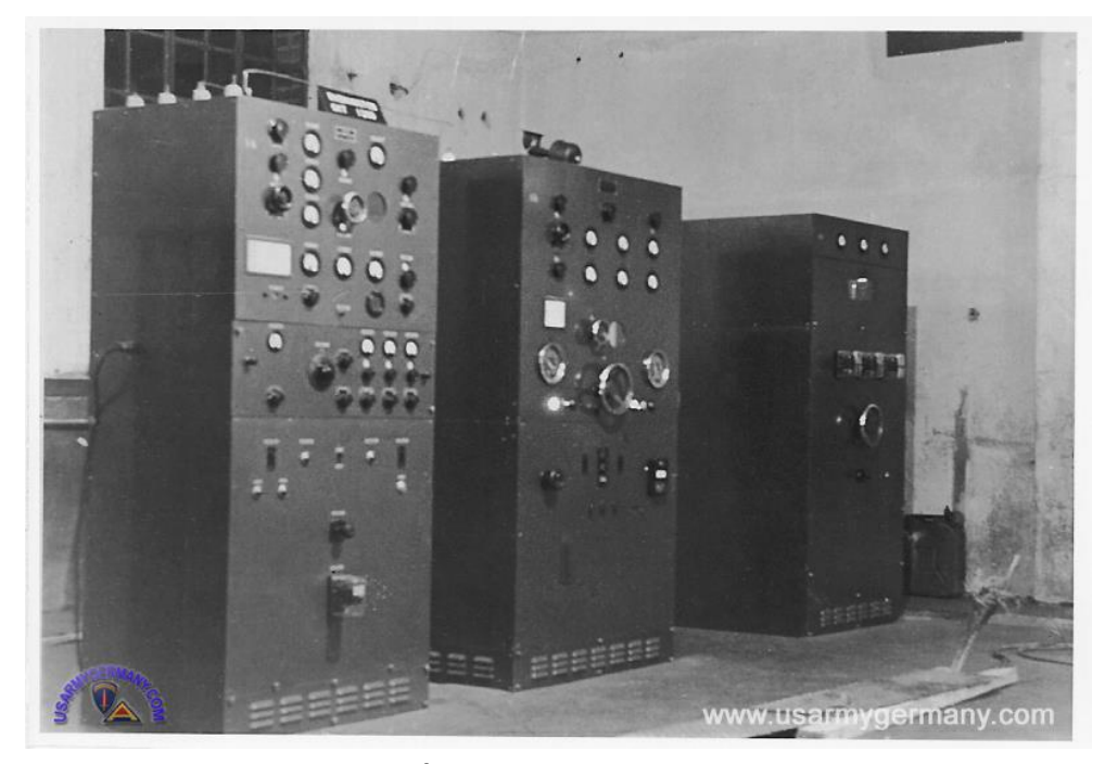
Visit the museum at N6JV.com

locations, so a still was provided. After the needed distilled water was produced, the Army personnel "re-purposed" the still and kept it very busy and popular with the troops.