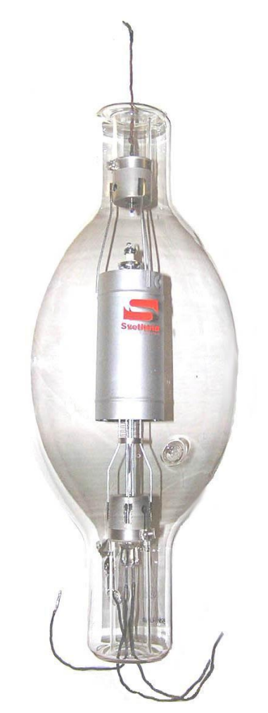
Visit the museum at: http://n6jv.com

In recent years these tubes have become rarely seen for sale in North America, but there is still some stock in former Soviet countries in Europe. The price has gone up and the postage for a large tube like this is also high. They would make a great lamp for the ham shack.