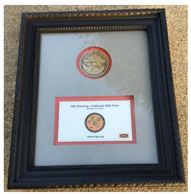
GOLD RUSH stations required.

Also a minimum of 150 QSO had to be logged and as a California station at least 75 of those I worked had to be non-CA contacts. So with that goal in mind and K6SZQ keeping a tally sheet, I managed to work all the