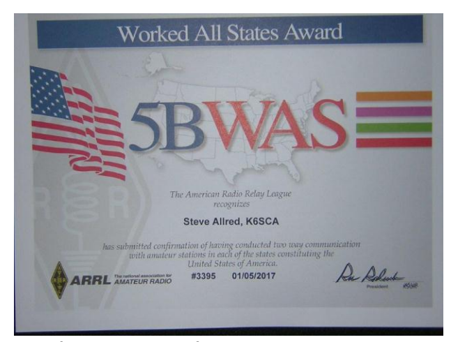
Band WAS award!

Now that all 50 states were confirmed on 5 bands (10, 15, 20, 40 & 80) I was able to submit my request to ARRL. When I got home from work one evening last week I noticed a flat white envelope from ARRL laying on the kitchen counter. Inside was my 5